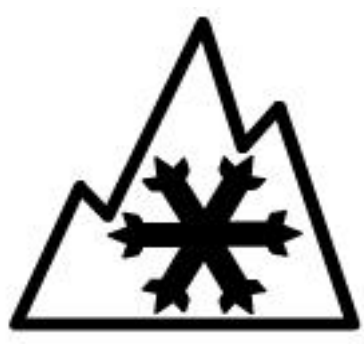
Severe winter traction icon

NOTE: Some newer tires are designed for use in severe snow conditions and are marked on at least one sidewall with the letters "M" and "S" (e.g., MS, M/S, M&S, M+S, etc.) plus have a pictograph of a mountain with a snowflake. If you need more information on tires designed for severe snow conditions contact the CTQP Administrator (at (810) 677-5745) or refer to Rubber Manufacturers Association, Tire Information Service Bulletin, Volume 37, Number 2, February 1999 and titled "RMA Definition for Passenger and Light Truck Tires for Use in Severe Snow Conditions." An example of the mountain/snowflake is shown below.